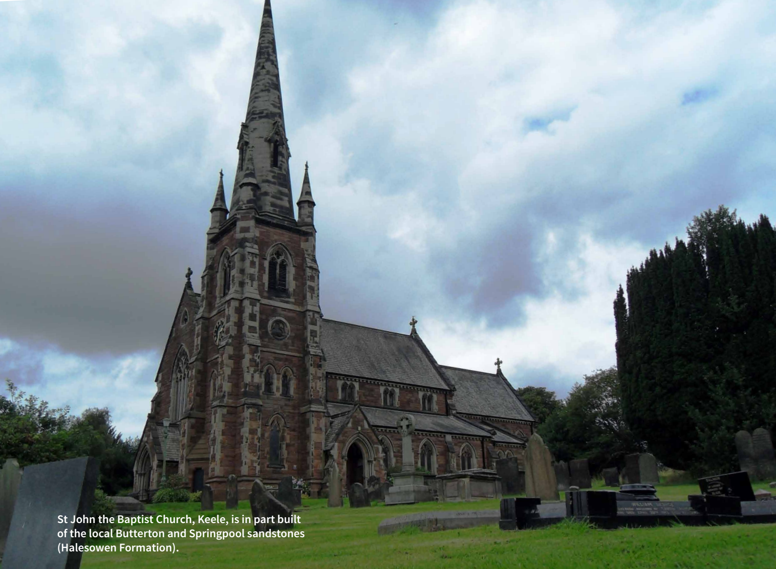
St John the Baptist Church, Keele, is in part built of the local Butterton and Springpool sandstones (Halesowen Formation).