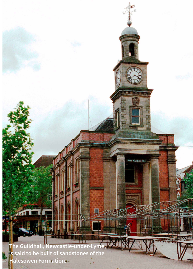
The Guildhall, Newcastle-under-Lyme, is said to be built of sandstones of the Halesowen Formation.

The Church of St. Editha in Tamworth is believed to be constructed of reddish brown Halesowen Formation sandstone (referred to as the 'Big Brown Sandstone' of the 'Coal Measures' in early Geological Survey accounts), but the rock is generally too friable to make a good building stone. A more common usage has been as tombstones, examples of which are seen in local graveyards around Newcastle and Stoke.