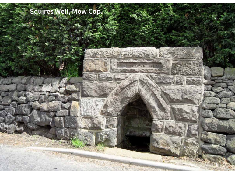
Squires Well, Mow Cop.

'Gritstone' yielded by outcrops of the Roaches Grit, the Chatsworth Grit and the Rough Rock is commonly used for drystone walling, but can weather badly (Cox, 2004).