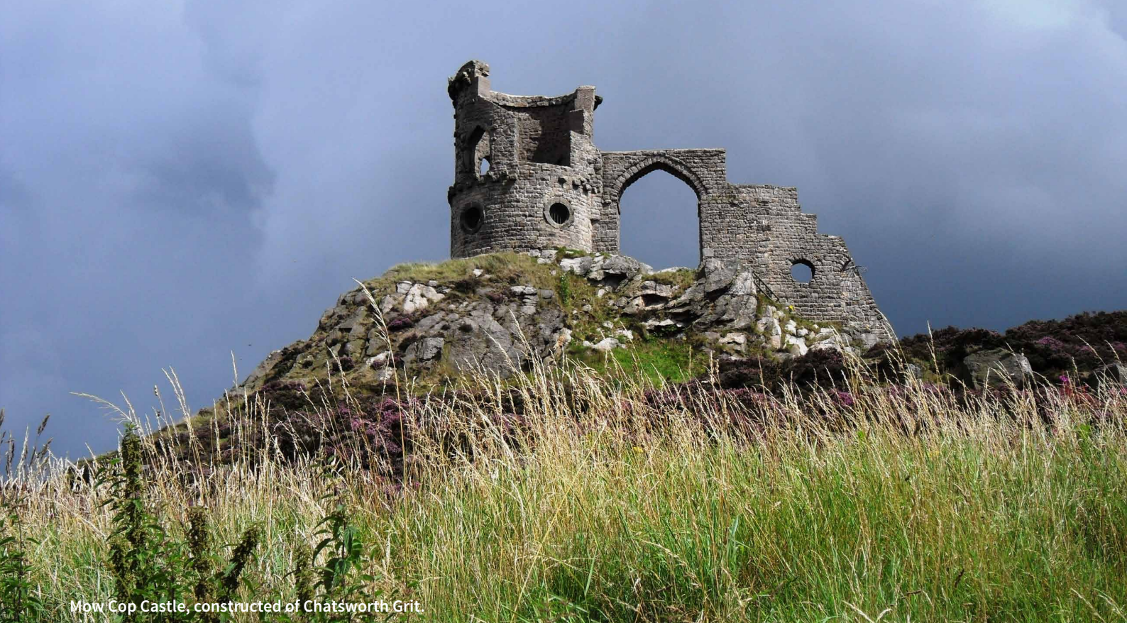
Mow Cop Castle, constructed of Chatsworth Grit.

The Chatsworth Grit sandstones are cemented to varying degrees by secondary silica, and they, along with Rough Rock sandstones, have been worked on the Mow Cop ridge. Mow Cop Castle (a summerhouse built in 1754 for the Wilbraham family of Rode Hall, above), Odd Road Church, Mow Cop, and many other buildings and walls in the villages lying along the ridge are constructed of Chatsworth Grit. The quarries at the northern end of Troughstone Hill, outside Biddulph, worked Chatsworth Grit sandstone for rough stonework in parts of Biddulph Grange, the rockery and walling in the gardens, and Squires Well, Mow Cop (below). Chatsworth Grit was also obtained from Bagnall and to the south of Brown Edge (Rees & Wilson, 1998).