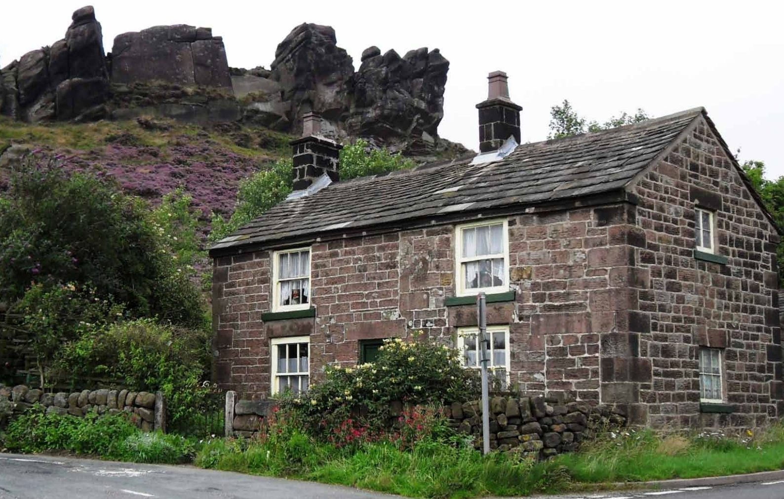
Cottages made from Roaches Grit sandstone.