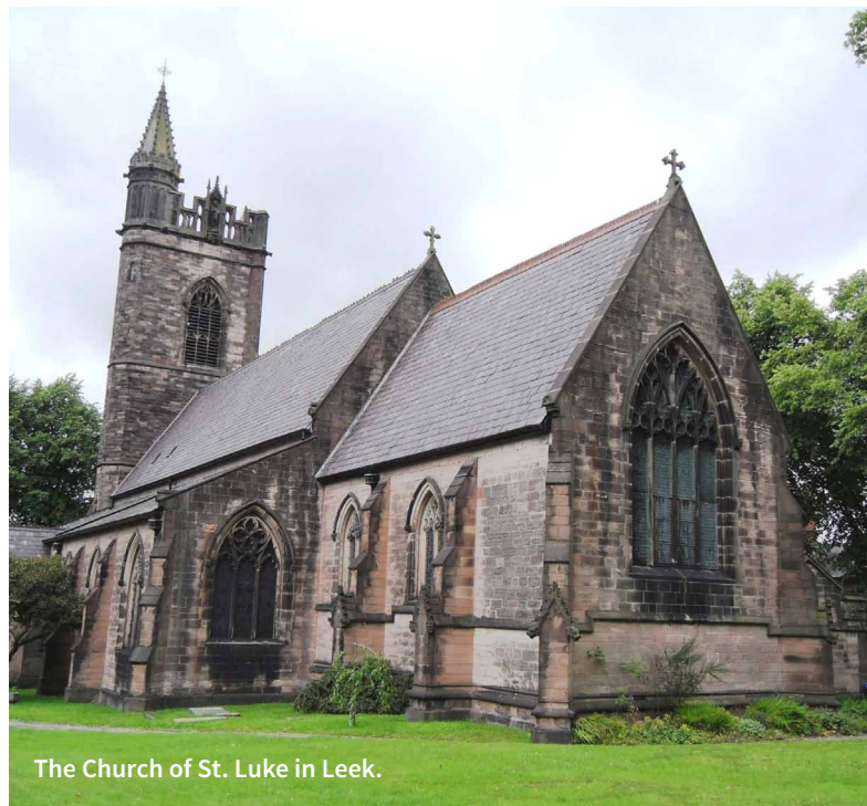
The Church of St. Luke in Leek.

The Church of St. Luke in Leek, Cheddleton Station (both below) and the Church of St. Giles in Cheadle are all constructed of squared and coursed blocks of sandstone from the 'gritstones' succession.