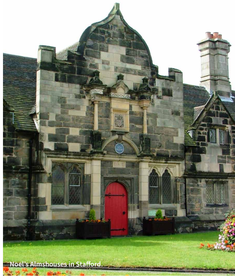
Noel's Almshouses in Stafford.

Elsewhere, the late 17th-century St. Chad's School in Lichfield provides a rare example of an urban house built entirely of Namurian sandstone, as are the Noel's Almshouses in Stafford (right), which exhibit well-coursed ashlar blocks. Vernacular buildings made from Roaches Grit sandstone include old farm buildings and nearby stone cottages (below).